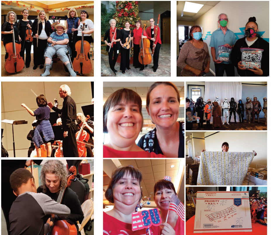
Clockwise from left: NVSO musicians performing at Life Care Center and National Bank of Arizona, Donating face masks to the Navajo and Hopi COVID-19 Relief Fund, Board members volunteering at Youth for troops, musicians performing at Lincoln Learning Center, a student conducting during the 2021 Wickenburg concert.

In addition to musical outreach, NVSO helps support other non-profits through events like volunteer days or food/toy drives at our concerts.