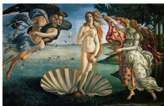
Birth of Venus

Georges Bizet (1838-1875) was a French composer of the Romantic era, and best known for his operas, especially Carmen . The incidental music to Alphonse Daudet's play "l'Arlésienne," which is usually translated as "The Girl from Arles," was composed by Bizet in 1872. It consists of 27 numbers for voice, chorus, and small orchestra, all ranging from short solos to longer entr'actes. l'Arlésienne Suite #2 was completed in 1879, four years after Bizet's death, by Ernest Guiraud. Within the selected numbers from the play's incidental music, the closing movement "Farandole" is based upon the French melody, "La Marche Des Rois Mages," or "March of the Kings."