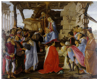
Adoration of the Magi